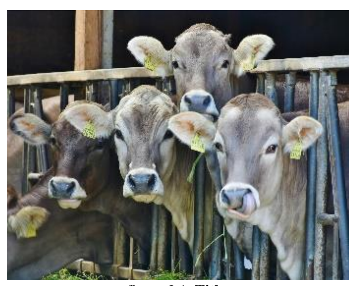
figure 3.1. Title.